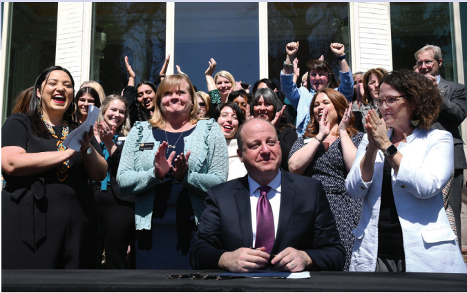
April 4, 2022 – Gov. Polis signed HB22-1279 into Law