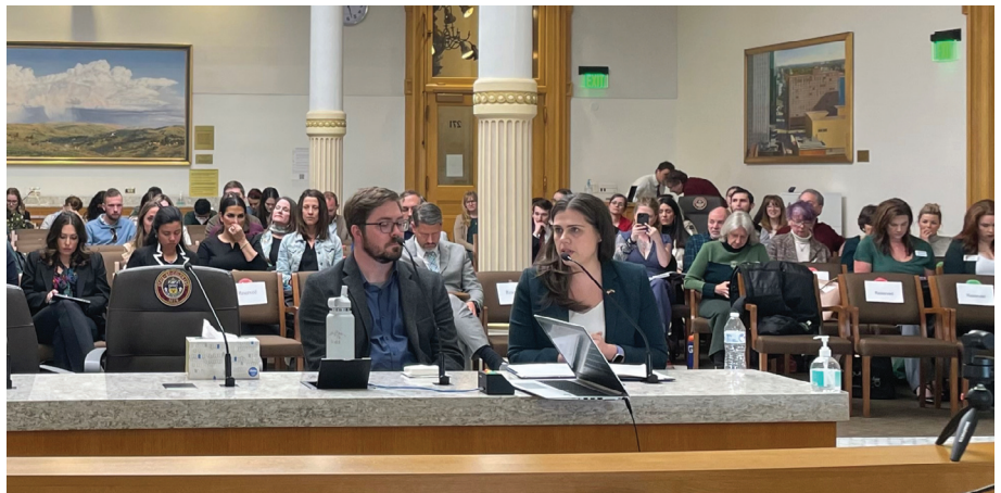
Sec. of State Jena Griswold & a constituent of Sen. Julie Gonzales' testifying in support of HB22-1279