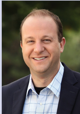
Governor Jared Polis