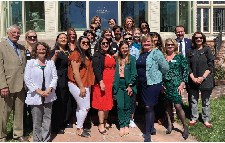
RHEA Signing Day: Sponsors, Advocates & Lobbyists Outside of the Governor's Residence

The U.S. Supreme Court has all but guaranteed they are going to eliminate federal protections for abortion with their upcoming ruling in Dobbs v. Jackson Women's Health Organization but we've seen the writing on the wall for decades and have been preparing for this moment. The loss of rights and bodily autonomy afforded to us by Roe v. Wade and Planned Parenthood v. Casey means the responsibility to maintain legal abortion will fall on individual states and their respective legislative leadership.