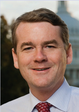
U.S. Senator Michael Bennet