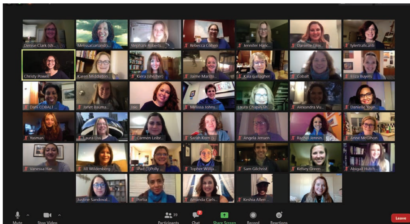
Cobalt Board and Staff members gathered in early December for a two-day Strategic Planning retreat.

Cobalt is small but mighty: 10 full-time staff, 10 part-time staff, 30 Board members